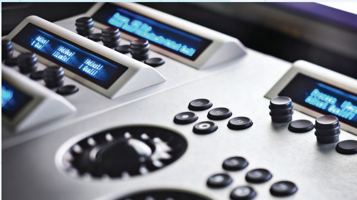
FLEXXITY Archive CP200 Control Panel

* max. 2 parallel video outputs per card