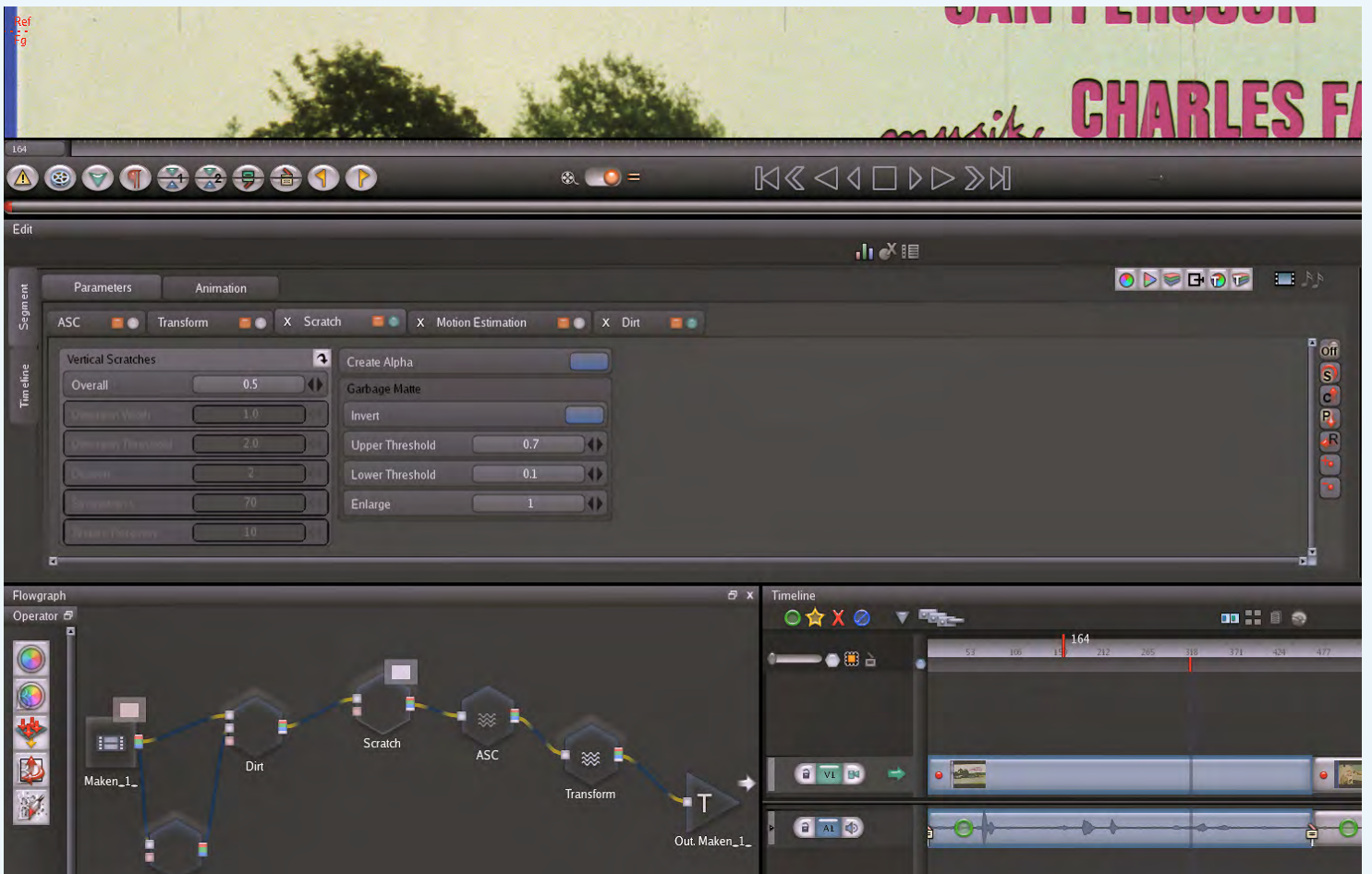
FLEXITY Archive – Integrated Image Processing – color correction, 1D or 3D LUTs, image transformation, optional grain reduction and contour enhancement and dust busting (dirt, scratch, retouching)