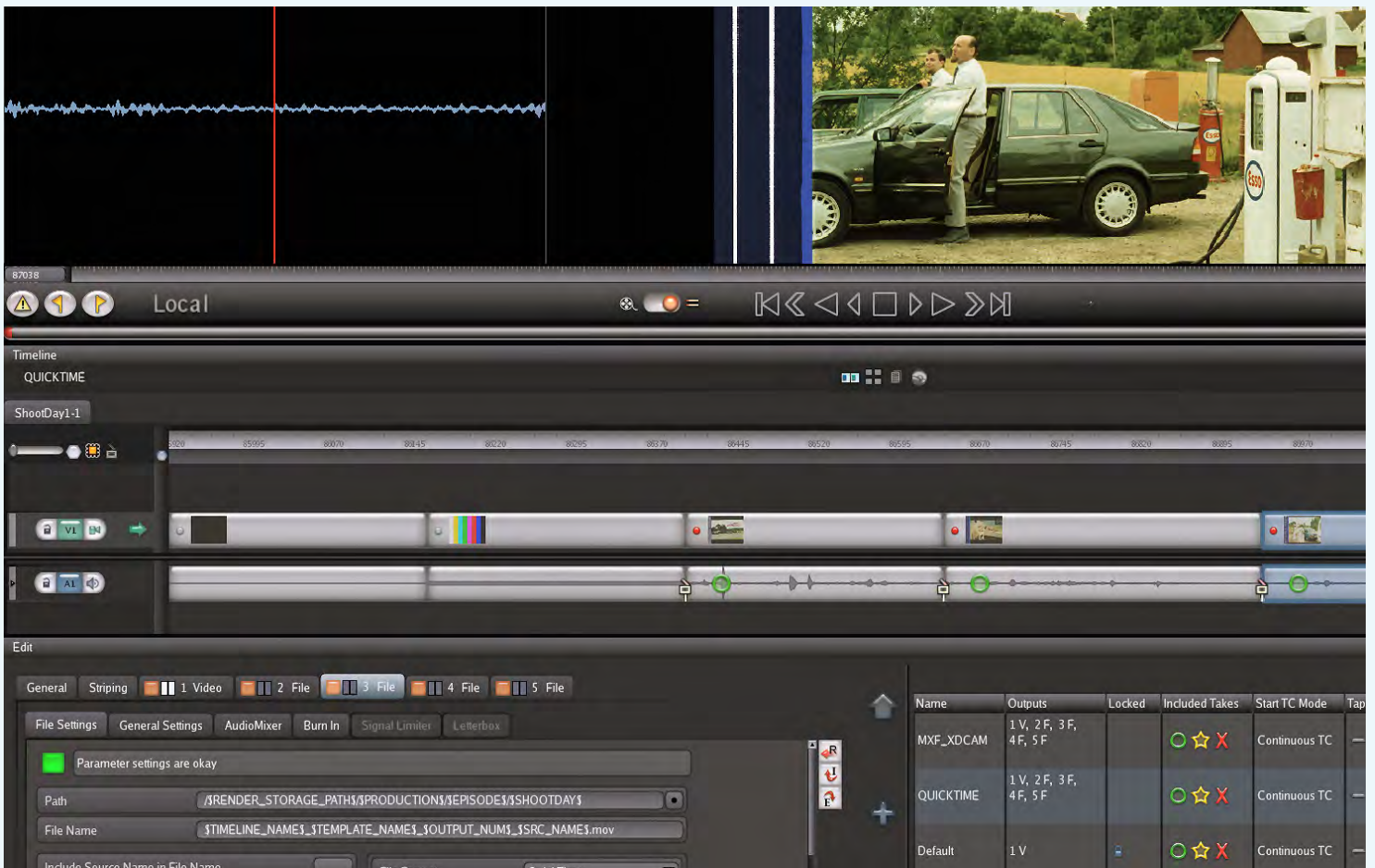
FLEXITY Archive – Output GUI for template based file and video media generation