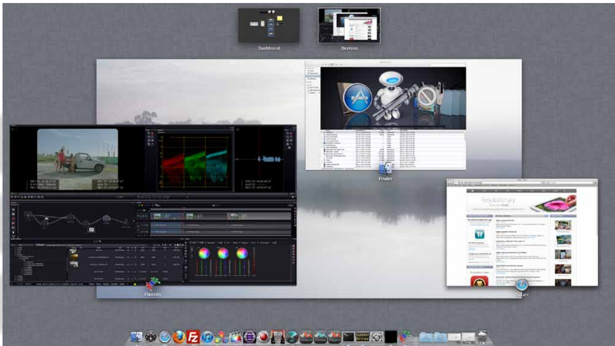
FLEXITY Dailies on Mac