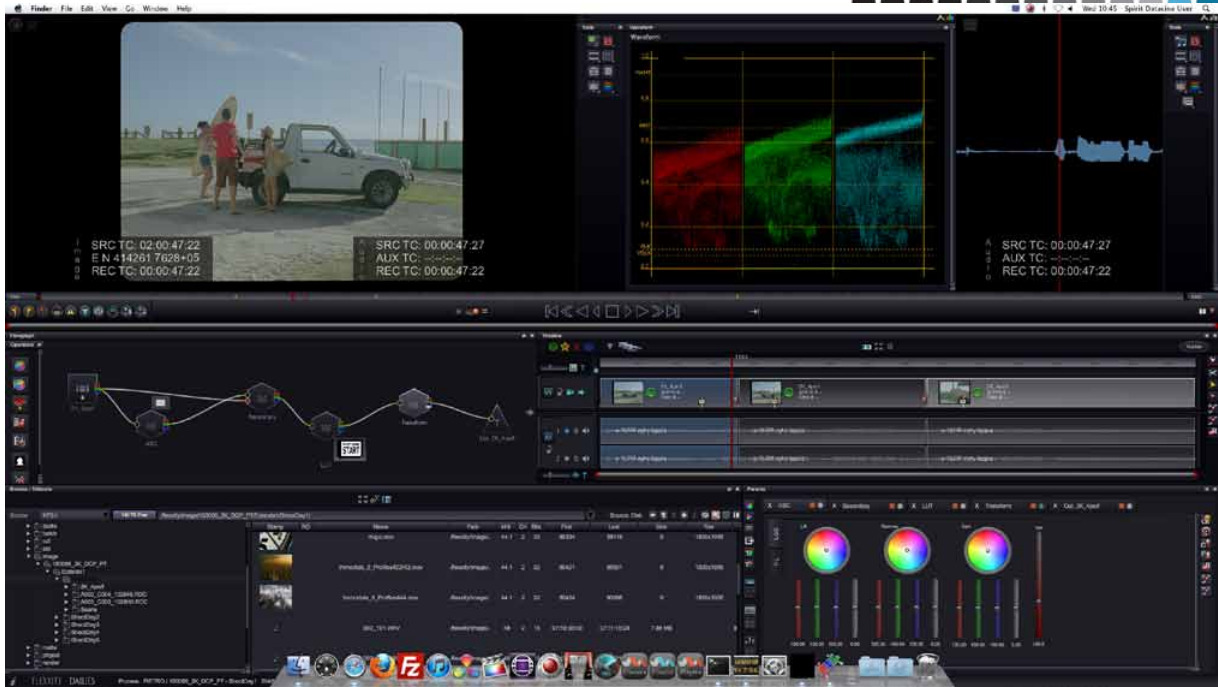
FLEXITY Dailies on Mac: Process page for timeline editing, synchronization and color correction