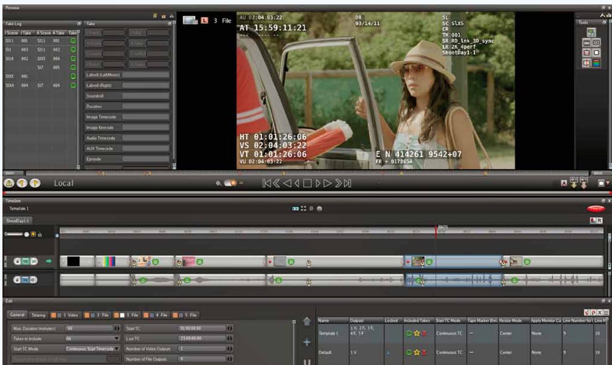
FLEXiTY Playout – Output GUI for template based file and video media generation