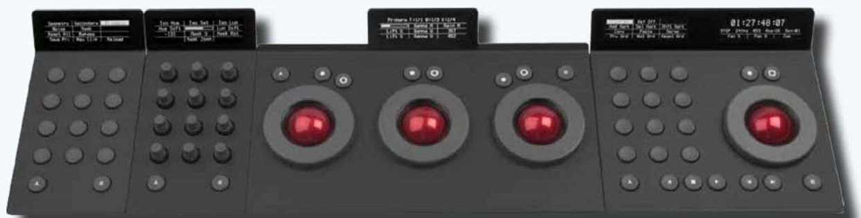
FLEXXITY Playout Element Control Panels

* max. 2 parallel video outputs per card