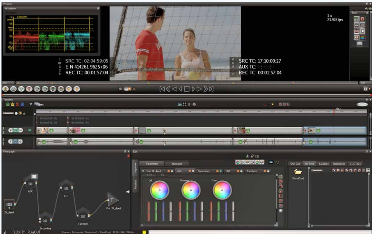
FLEXiTY Playout – Optional Image Processing includes; color correction, 3D LUTs, image transformation, dissolves, grain reduction, contour enhancement and dust busting